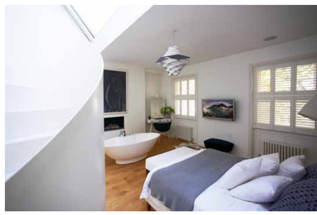
A helical staircase in the bedroom leads to a galleried office and roof terrace, where the skylight is controlled by the push of a button.