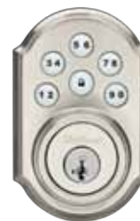
Kwikset SmartCode™ Deadbolt with Home Connect™ Technology

Kwikset®, the leader in residential security, provides a smarter way to expand your security solution. With Home Connect™ Technology, a Kwikset SmartCode™ keyless entry lock enhances security, expands functionality and adds value to your total solution.