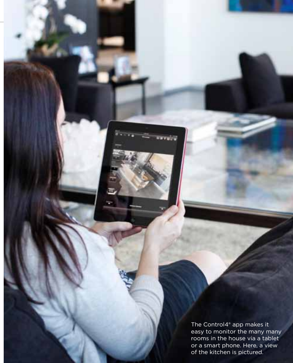
The Control4® app makes it easy to monitor the many rooms in the house via a tablet or a smart phone. Here, a view of the kitchen is pictured.

Ultimately, it's different every day. Though, really, it's a lot of watching things and reading things. Other than that, it's driving from point A