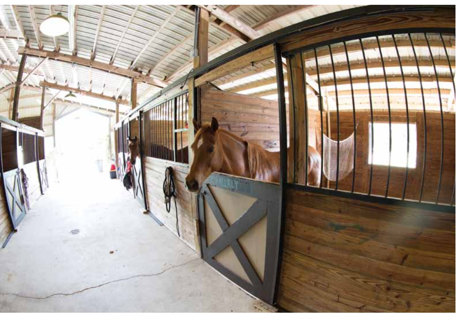
Each of the ranch's 15 horses receives fresh water via an automated system, as do the pigs, goats, and guinea pigs (oh my)!

creatures that benefit. The watering and feeding mechanics for the animals are also automated. That's great news for Rose, Crystal, Desperado, and the rest of the non-human residents on the ranch. Seems you can bring a horse to water, and make him drink—if it's on the Control4 system, anyway.