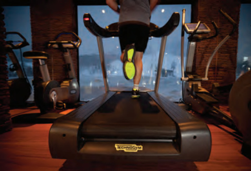
Ah, the panoramic view from the state-of-the-art gymnasium alone is bound to get any blood pumping!

powered computer where, perhaps after a long day on the slopes, you can check your email or browse the web. That same iPad will let you control blinds, lighting, under floor heating and why, look... there’s a one-touch button option called “Duvet Day,” which will automatically close the blinds and lower the lights, creating just the right atmosphere for those times when all you want to do is enjoy a good old-fashioned hibernation. On the third floor, western red cedar, black granite and glass frame a perfect version of paradise looking out over the Happo