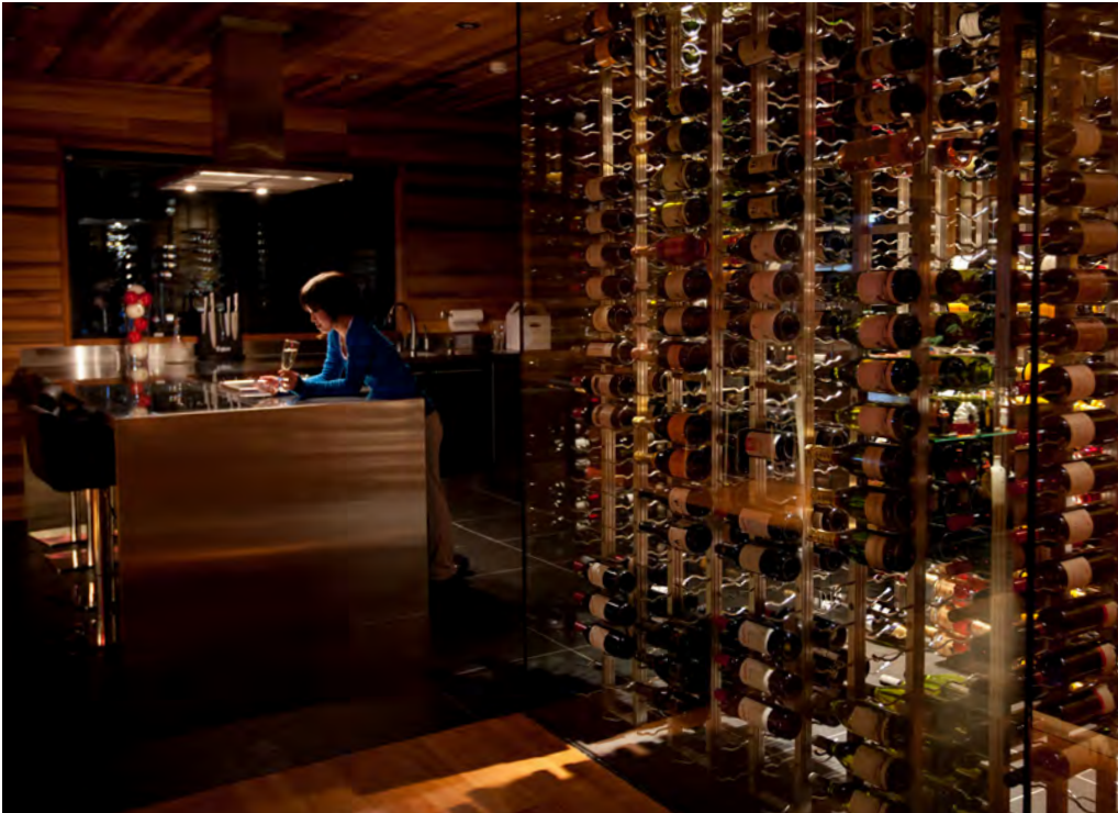
The expansive wine room, including multiple bottles of Dom Perignon, is climate controlled by the programmed shades, which open and close accordingly—and automatically—all year long.

But don’t think for a nanosecond that the system could ever control the owners: “We travel a lot and