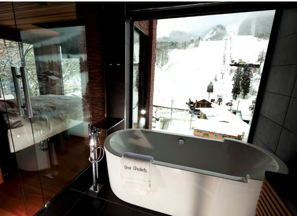
In each en suite bathroom, you'll find an iPad or touch screen next to the tub. Queue up your favorite music and stream it through the ceiling speakers as you soak your cares away.

“I’m not ashamed to admit that we set out with utter perfection in mind for all aspects of building One Happon, but the home automation aspect is the piece that has guests consistently enthralled.”