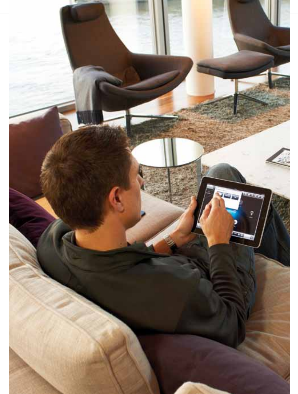
Film fans can adjust the angle of the television remotely. Or pause the movie and lift the blinds to catch a sunset over the Thames, all without leaving your seat.

even when he's not. It also comes in handy when, for instance, the housecleaners need some extra light to do their job.