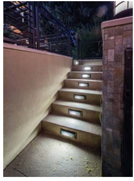
These stair lights can be brightened when company's expected and dimmed after everyone leaves.

and it's not hard at all to step into a Control4® system." He pauses, and adds, "The biggest thing was they wanted more control over lighting."