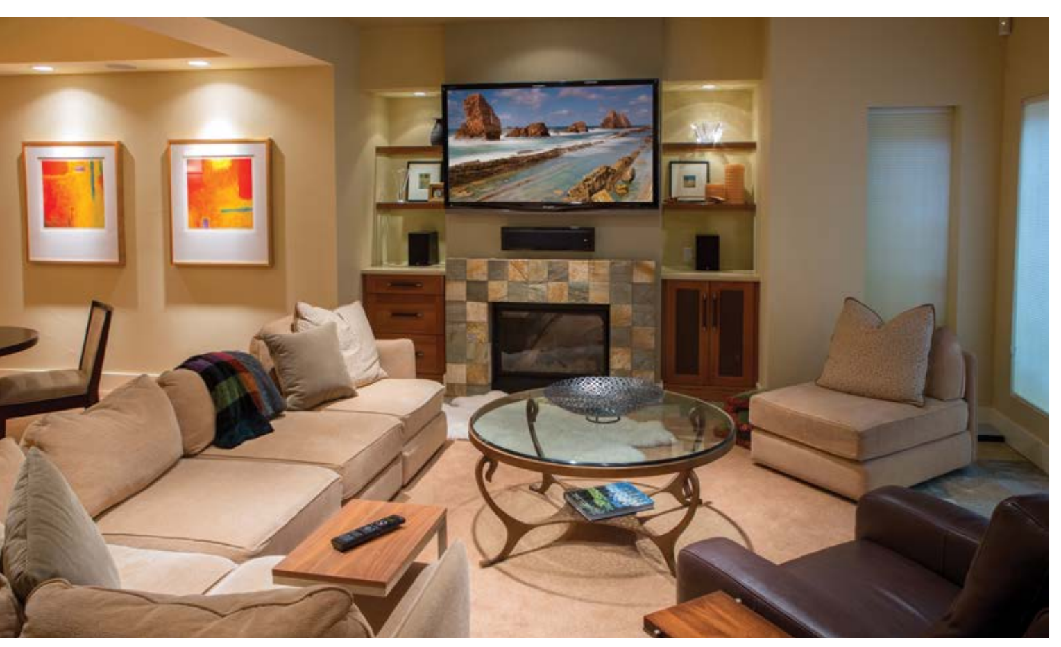
Label one button MOVIE, and program it to dim the lights, close the blinds, raise the temperature, and turn on the TV to your favorite station all at once.

leave lights on 24 hours a day for seven or ten days. I'd feel guilty about it, but I didn't want to leave a dark house. I'd say, 'you know we just announced to the world that we're out of town because our outside lights are on 24 hours a day.' Now we can do a Vacation mode where the lighting is sporadic, different lights going on and off at different times. It adds a whole level of security to going out of town." The lighting scenes certainly add convenience and ease to Sallie and Mike's home life.