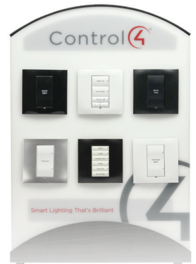
240V Square Smart Lighting Display