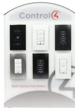
240V Smart Lighting Display